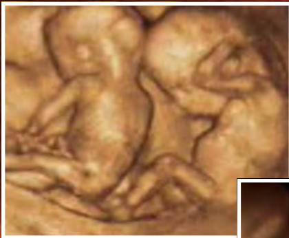
1st Trimester - Twins