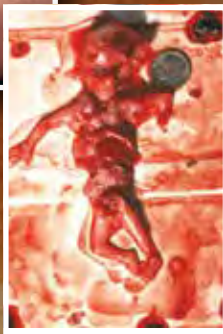
10-Week Aborted Baby

There are one million abortions performed every year at 700 abortion centers in America.