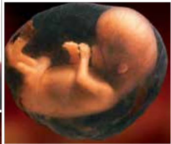
1st Trimester - 10 Weeks Gestation

Testimony during removal of ruptured tubal pregnancy