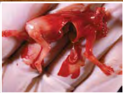
11-Week Aborted Baby

Legalized in 1973 throughout all nine months, abortions have exterminated over 62 million babies in America