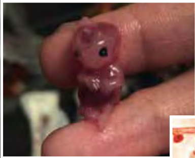
7-Week Pill Aborted Baby

"We lied...we would say it's not a baby yet. It's just tissue... like a clot."