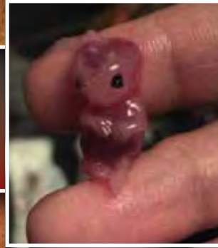
7-Week Pill Aborted Baby

There have been approximately one million surgical abortions performed every year in America since legalization. But with the introduction of medication abortions, approximately half of all abortions are now chemical exterminations.