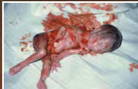
3rd Trimester Exterminated Baby